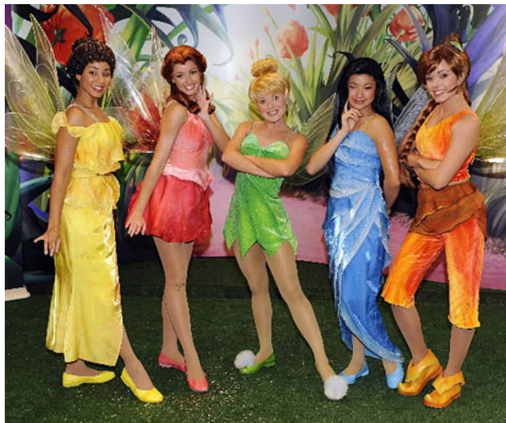
The Magic Kingdom's newest attraction -- Pixie Hollow -- features Iridessa (from left), Rosetta, Tinker Bell, Silvermist and Fawn. The Disney Fairies are a new set of characters, developed for books, movies, Internet games and merchandise.