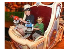
Photos: Orlando's newest rides and attractions

Photos: Orlando's newest rides and attractions Photos