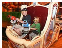
Photos: Orlando's newest rides and attractions

Review Orlando Things to Do and See During the Christmas Holidays ChristmasInOrlando.com