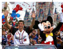
I'm going to Disney World!

We encourage conversation about our stories and hope you will share yours. We do have some rules of the road: no comments that are obscene, sexual in nature, racist or otherwise inappropriate. If you post such comments, we will remove them. -- Orlando Sentinel